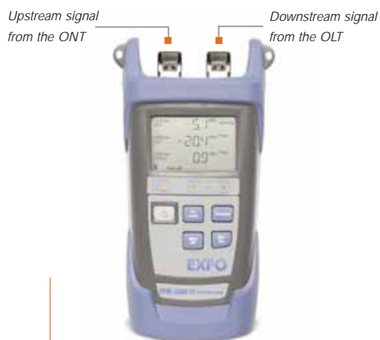
The PPM-352B-EG two-port power meter.

The industry's first PON-specific power meter, the PPM-350B is the flagship of EXFO's line of test instruments specifically intended for FTTH and FTTP systems. Available in four models, the PPM-351B, PPM-352B, PPM-352B-EG and PPM-352B-EG-ER, it is the ideal tool for FTTH/FTTP service activation and troubleshooting.