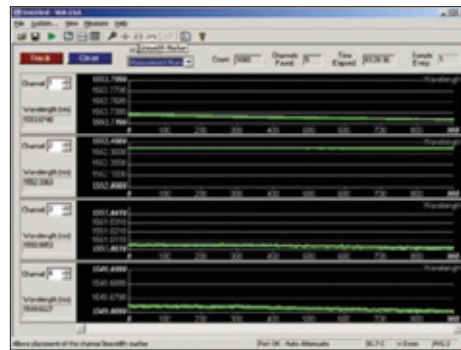
Trend analysis measures changes in wavelength over time.

To enable more detailed analysis, data collection by the WA-650 can be paused at any time to hold the most recently displayed spectrum. Or, the spectral data can be saved for future analysis. What's more, trends in laser spectral performance, such as frequency drift, can be analyzed over time with a real-time plot.